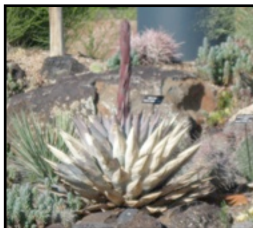
This apparently dead agave manages to put out a flower stalk.