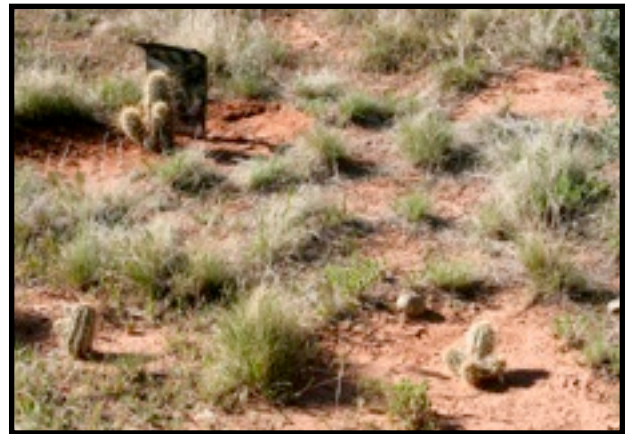
Above on the left, Pam Johnson stands guard over a easy-to-step-on Opuntia. (Center) A blooming pedio hides in the grasses. (R) An example of cacti planted among native grasses & natural habitat.