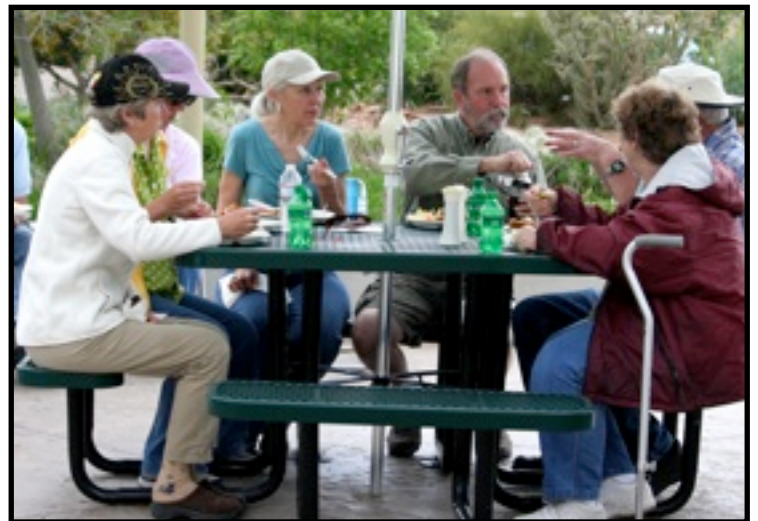
Chinle members "chow down" a delicious meal after the tour.