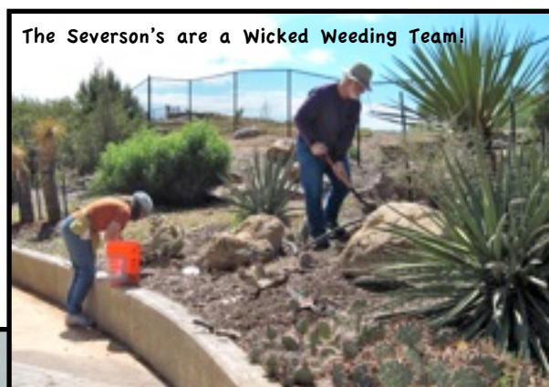
The Severson's are a Wicked Weeding Team!