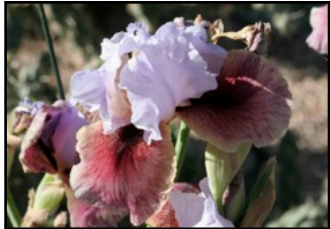
The combination of cacti & iris in their garden is very effective.

Second Stop - Tom Burrows: Our second stop was at Tom Burrow's home, with its monumental views, an example of which is shown here. He has cultured his large piece of property into a near-perfect example of returning an area back to its native grasses and habitat