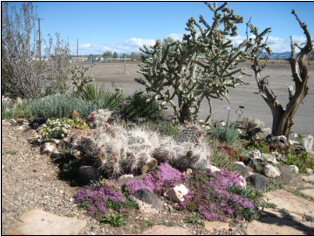
It's just plain beautiful at the CSU Garden.