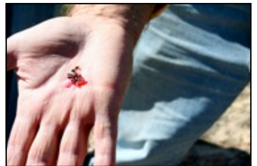
A prize specimen observed on Old Gordon's Trail was the Escobaria missouriensis . Here Don shows the contents of the bi-annual red fruit, with sweet flesh and black seeds.

Old Gordon's Trail also provided examples of Claret Cup cactus ( Echinocereus triglochiatius ), mountain shrubs (Fendler's bush), many Opuntia species of varying species and incredible views of the Grand Valley, Grand Mesa, and the Bookcliffs.