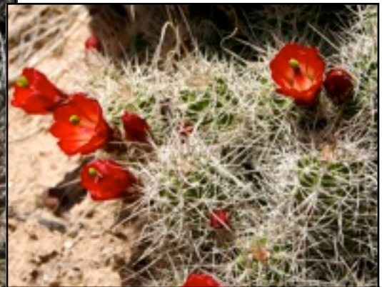
On the left, In Cactus Park, a Sclerocactus glaucus & Pediocacti simpsonii share a spot; Above is one of several Claret cups

Look on our Chinle Website for a gallery of photos from this Field Trip www.chinlecactusclub.org to be posted in the near future.