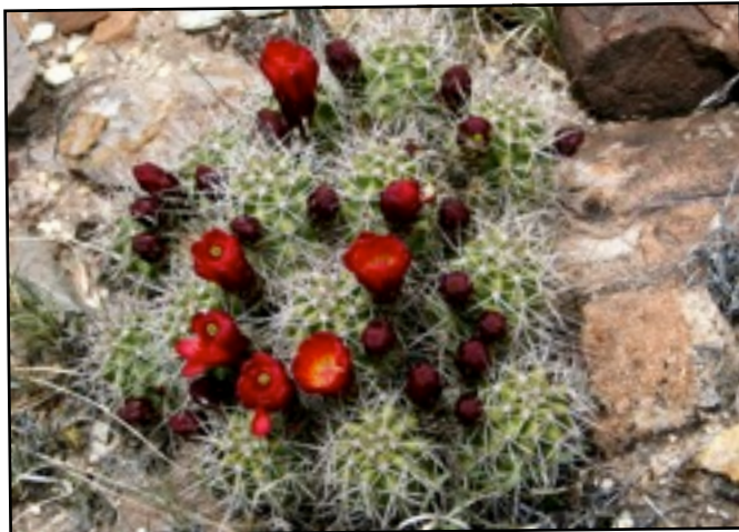
The lovely Claret Cup was one of the few cacti in flower in Escalante Canyon.

The afternoon activities began with a drive to Escalante Canyon to view Pediocactus simpsonii and Sclerocactus glaucus --the hookless variety that are on the endangered species list.