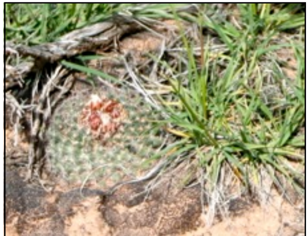
Pediocactus simpsonii in Escalante Canyon area.