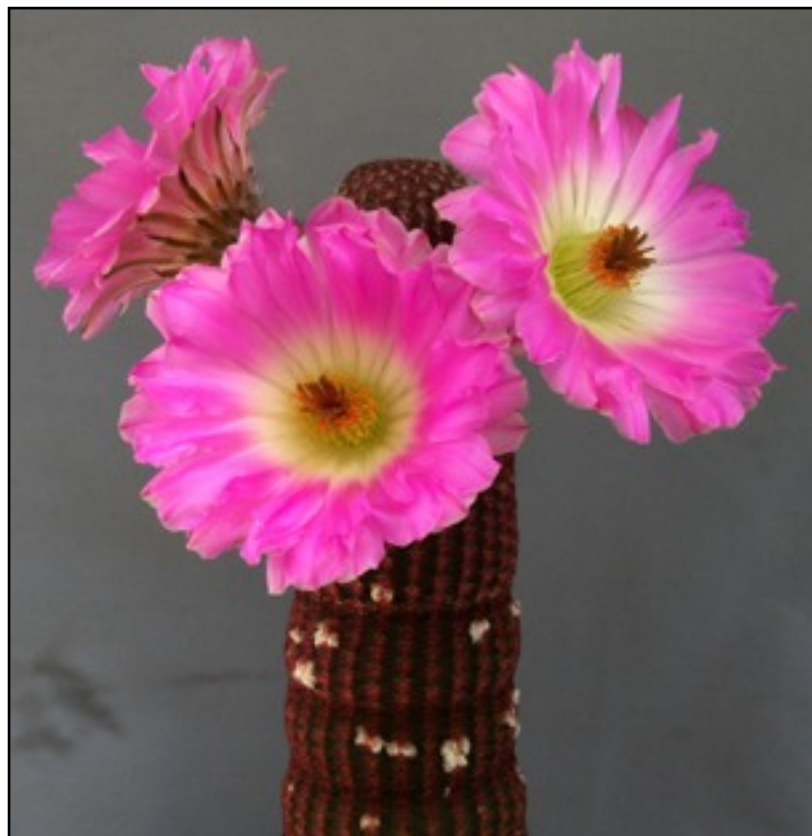
Echinocereus rubispinus on 4-15-11