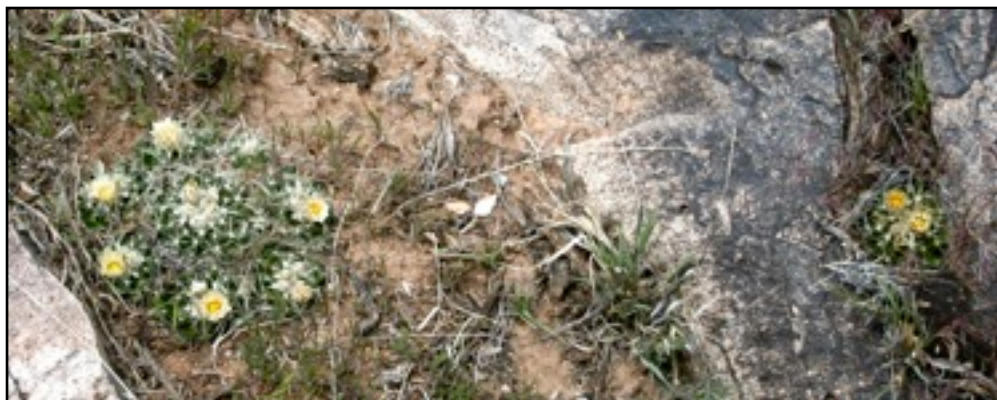
A real find on the road into Escalante Canyon--a multiheaded Escobario missouriensis in bloom-- spotted by Carol Campbell,