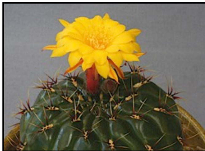
Matucan aureiflora - 4-11/11