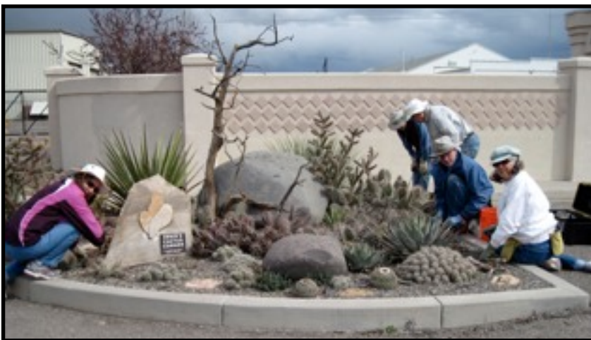
Ernie's Cactus garden gets some TLC on 4-9-11!