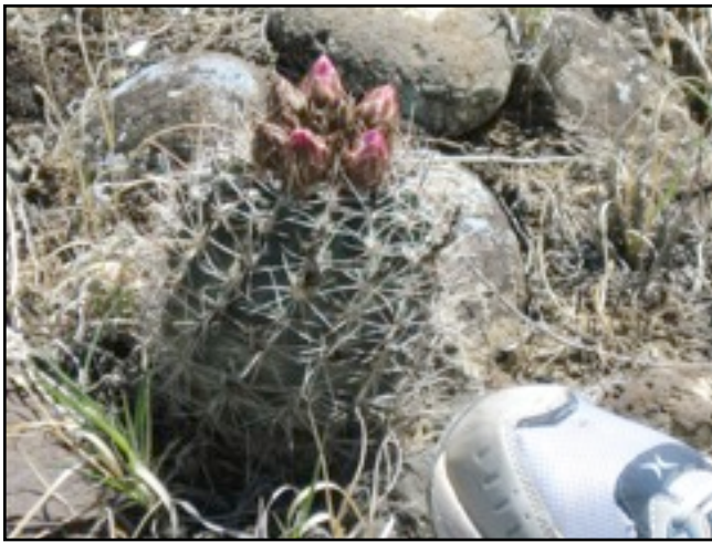
Endangered Sclerocactus glaucus, alive and well in the Kannah Creek area.