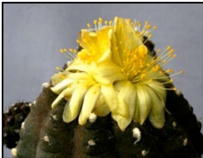
Copiapoa barquetensis - 4/8/11