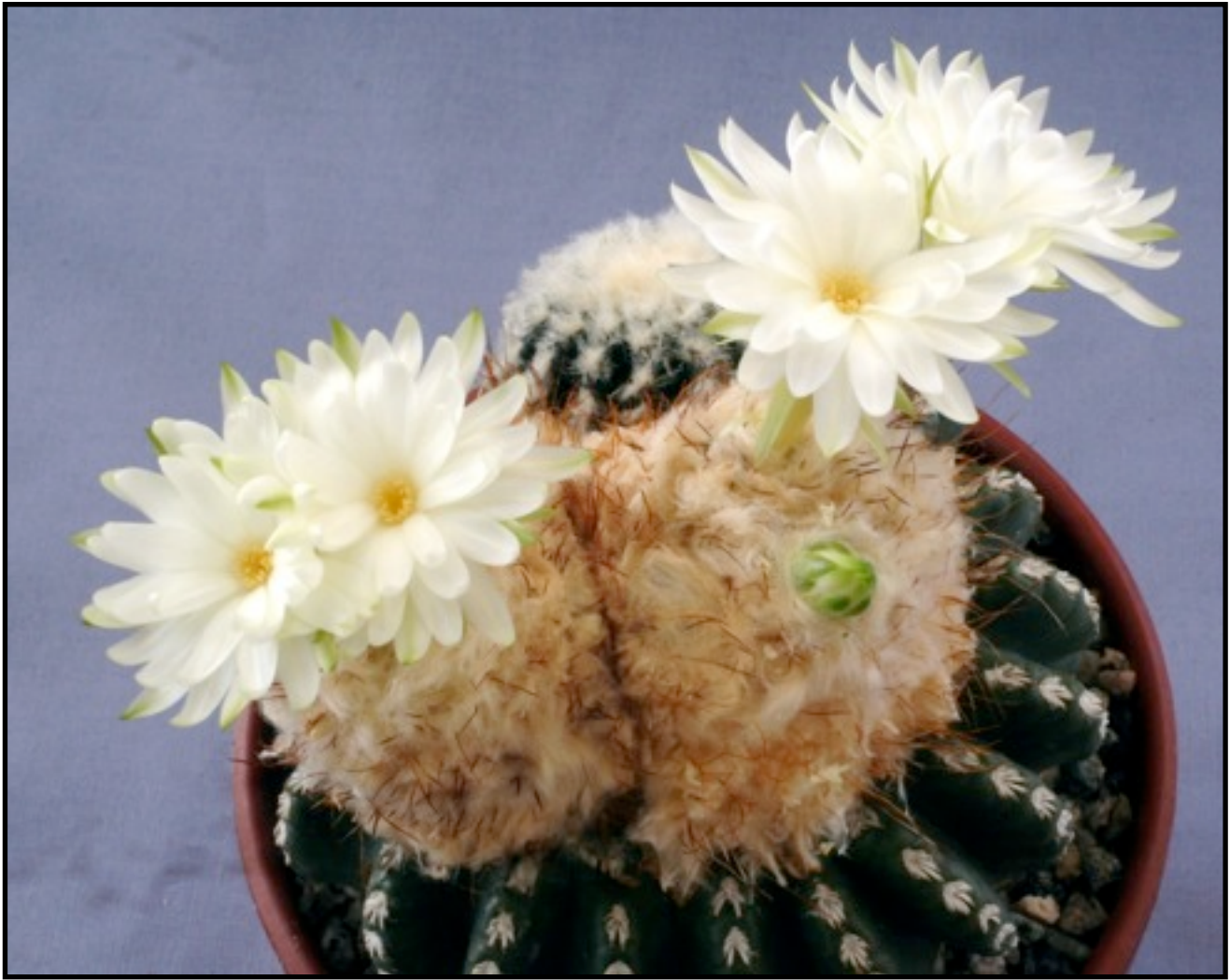
Discocactus horstii Early on the morning of April 13, 2011