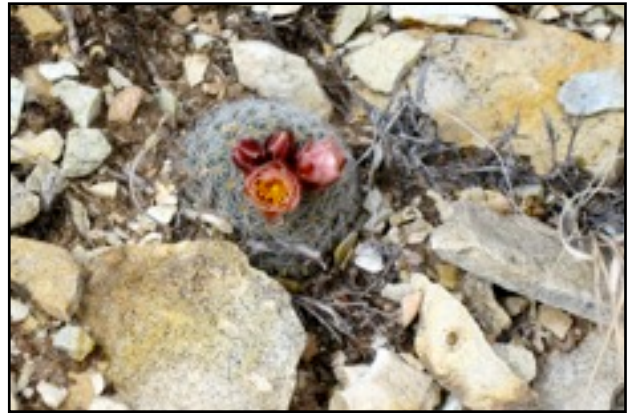
Pediocactus simpsonii blooming in Kannah Creek area.

After Escalante Canyon, we drove to the Kannah Creek area to view more Pediocacti, Echinocereus triglochidiatus, Sclerocactus glaucus, and the more common “Fishhook” Sclerocactus parviflorus.