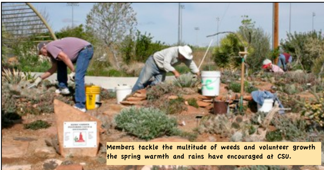
Members tackle the multitude of weeds and volunteer growth the spring warmth and rains have encouraged at CSU.